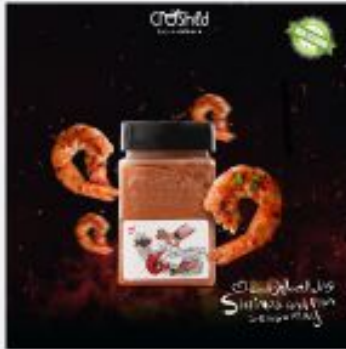
Shrimp and Fish seasoning

Crushed seasoning is characterized by quality and delicious taste with 100% natural and healthy ingredients.