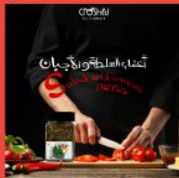
Salads and Cheeses herbs

Chicken seasoning consists set of high-quality spices and herbs in precise ingredient to give a distinctive taste to chicken dishes. Used to make chicken shawarma, chicken skewer, grilled chicken and chicken tagines.